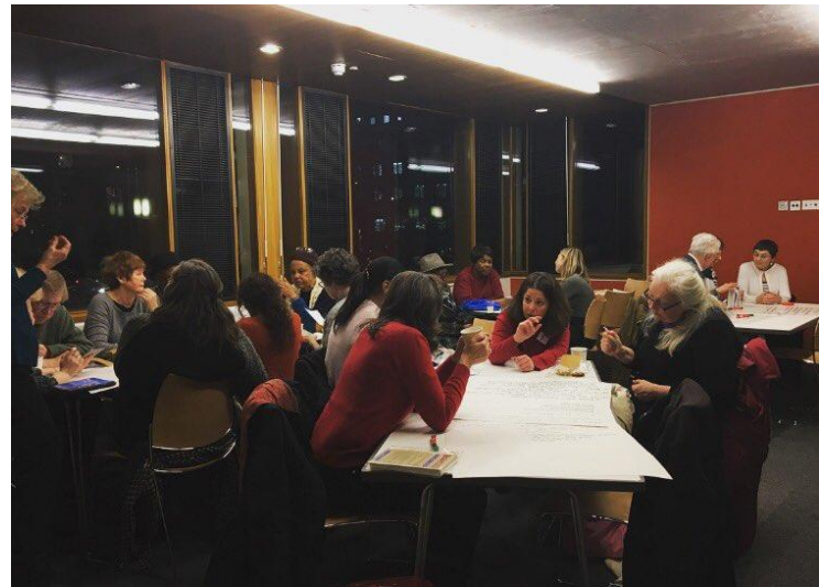
Discussing the new plans for NHS services

Going forward, we will continue to work with them to join up their work, and to make sure all issues are taken to the relevant providers.