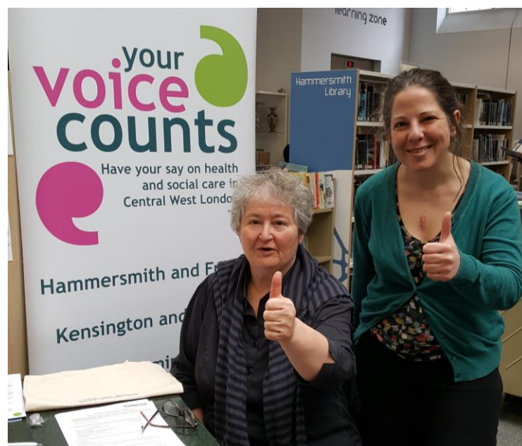
Outreach at Hammersmith Library

Each Clinical Commissioning Group (CCGs) in the three boroughs held an event about the STP for the public, and in Kensington & Chelsea we chaired the West London CCG event.