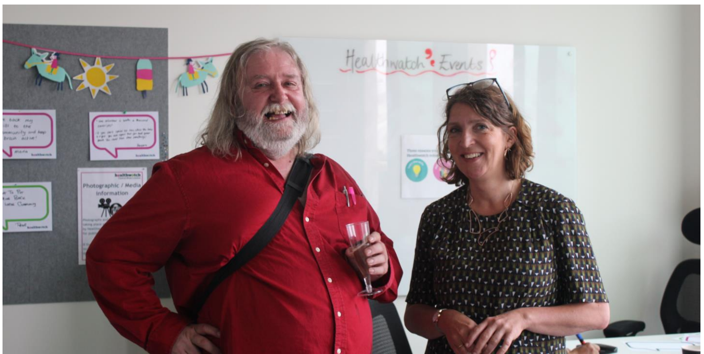
Volunteers and staff at our 2017 Volunteer Party

It's been great to meet so many of you at our Engagement Days between January and March. If you haven't met the new team yet, make sure to look out for future engagement events during the summer.