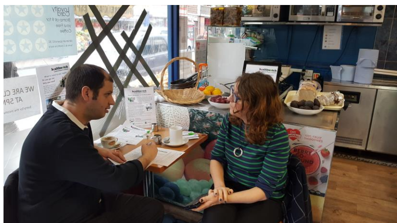
Talking to people in North End Road about accessing information on their health

Our How to Complain and Access Support guides will be published in the autumn of 2017. Make sure you are signed up to our mailing list to receive more information on when they are going to be available.